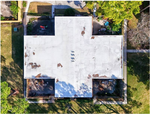
ROOF - CONCRETE WITH TPO COVERING